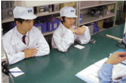
Job-experience program participants

according to production drawings and then inspecting them. We plan to continue this job-experience program in the future.