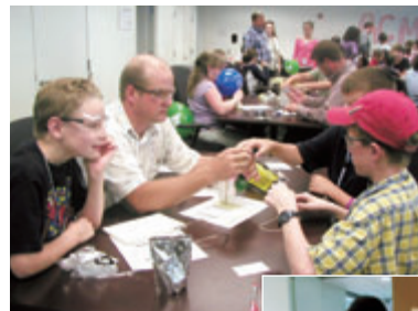
Volunteers help out at an elementary school

The company also distributes information via its intranet and newsletters on a variety of topics, such as car-pooling, to encourage employees to take action in their everyday lives to help the environment. In addition, the company is now promoting 4R activities, after adding the aspect of "rebuy" to its former 3R activities (recycle, reduce, reuse), and is encouraging employees to buy and sell unneeded items among themselves. Employees are also being asked to bring to work recyclable items that cannot be recycled at home (such as paper, cardboard, cans, glass and plastic bottles, batteries, and mobile phones) so that they can be recycled by the company.