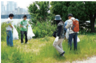
Volunteers clean up the area around the Yodo River

The TEL Group's three business sites in the Kansai region teamed up to clean up the Yodo River in Osaka City. This activity was organized by the TEL Group jogging club, which trains on the riverbank. A total of 57 employees and their families participated. The participants were divided into three teams, which competed with each other to see who could collect the most garbage. The TEL Group is committed to continuing to make contributions to local communities through such activities.