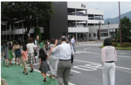
A plant tour

Tokyo Electron AT Ltd., Tokyo Electron PS Ltd., Tokyo Electron Tohoku Ltd. and Tokyo Electron Kyusyu Ltd. invite their local neighbors to participate in plant tours in the hope of boosting communication with local communities and ensuring that their neighbors are aware of the company's operations. We received a great deal of positive feedback from participants, including those who said: "Even though I live not too far from the plant, I've never had an opportunity to tour it. So thank you for providing this chance to see the plant"; or who said: "I see that the inside of the company is very clean and that you are very careful in handling your products. Thank you very much for enhancing communication with members of the local community despite your busy schedule."