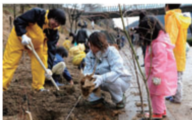
Tree planting in Kyushu

TEL is also planting trees in the U.S. For example, at Tokyo Electron U.S. Holdings, Inc., headquartered in Texas, and at TEL Technology Center, America, LLC, located in the state of New York, employee volunteers are planting trees at the sites where their offices are located.