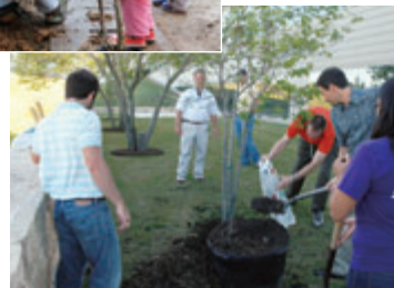
Tree planting in the U.S.