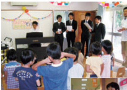
Recently-hired employees participate in social contribution activities as a part of their training. (Japan)